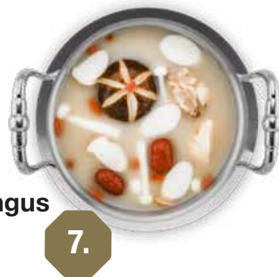
7. Old Hen Fungus Soup 老鸡菌汤