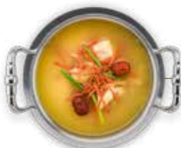
08. 虫草鸡汤 $6.90 ++