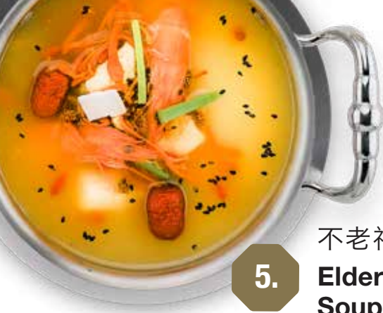
5. Elderly Tonic Soup 不老神汤