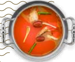
13. 微辣汤 $6.90 ++