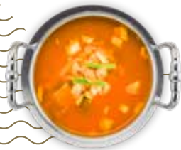
11. 泡菜酸辣汤 $6.90 ++