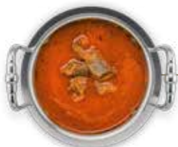
09. 牛肉咖喱汤 $6.90 ++