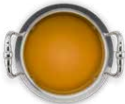
10. 斋汤 $6.90 ++