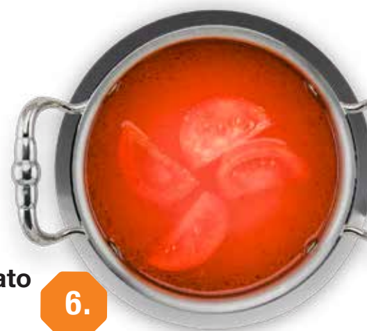
6. Pure Tomato Soup 纯番茄汤