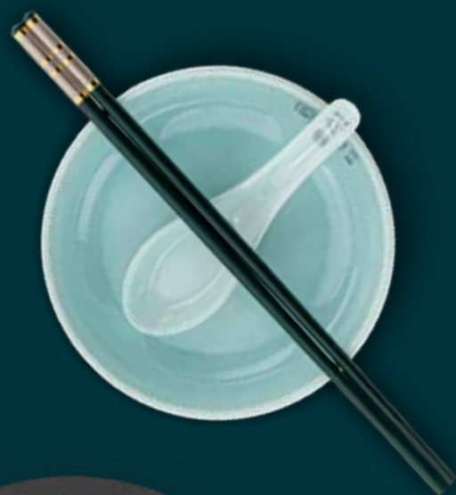
虫草乌鸡汤 Beauty Soup