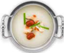
15. 滋补汤 $6.90 ++