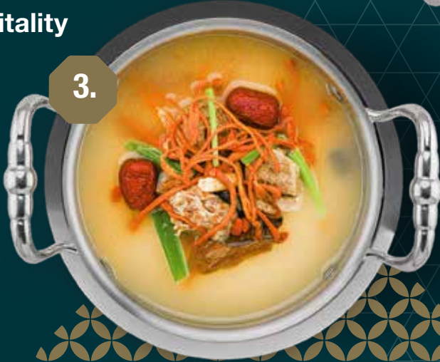
虫草老鸭汤 Male Vitality Soup