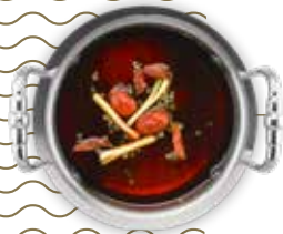
12. 麻辣汤 $6.90 ++